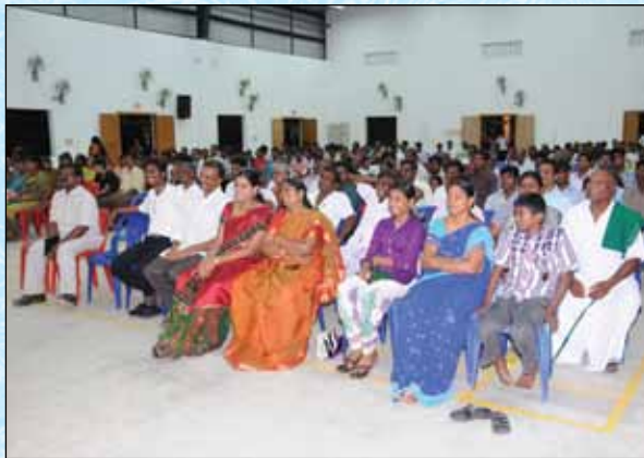
Mugavari Family Function, 15-07-2012