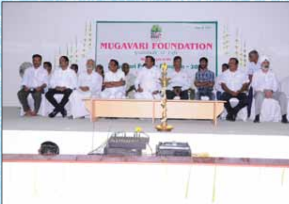
Mugavari Family Function, 15-07-2012