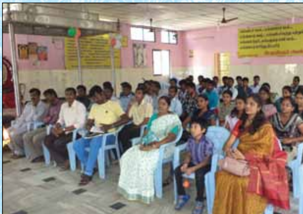
Mugavari Day, 16-02-2013