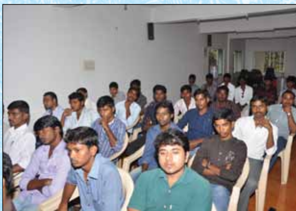
Mugavari Day, 16-02-2014

Do not build your life on ethics, morality, and values. Learn to look at life just the way it is. Sadhguru