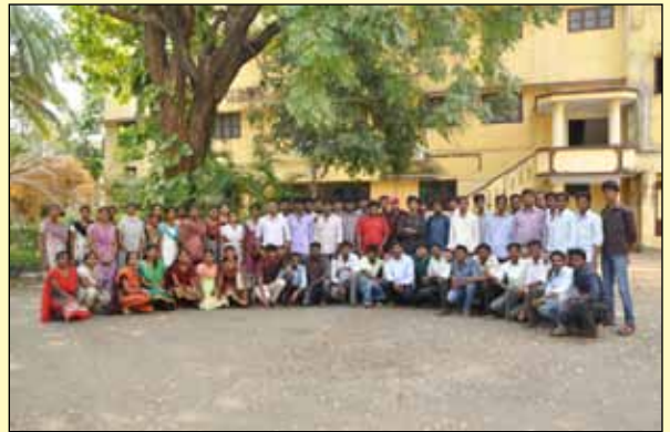
Students studying in Chennai