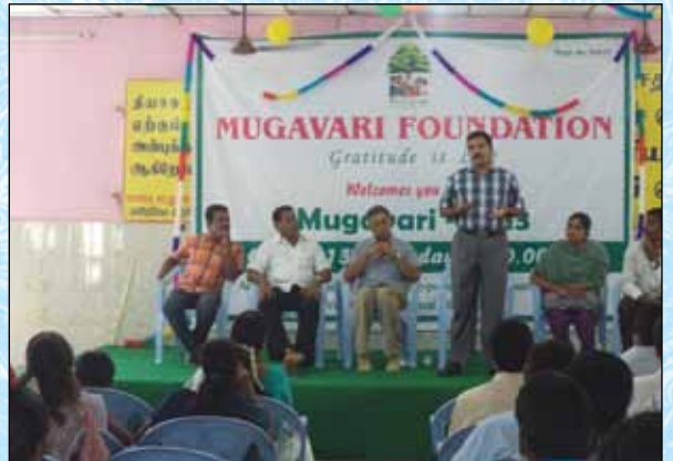
Mugavari Day, 16-02-2013