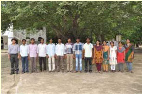
Civil Service Aspirants