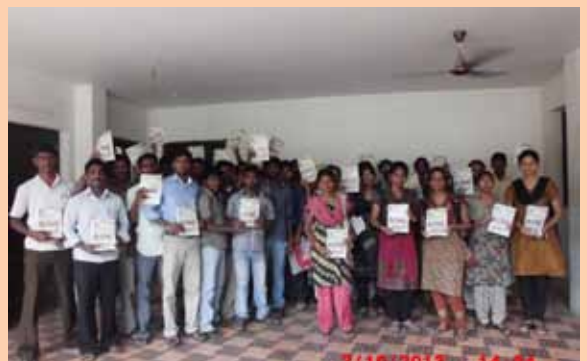
Students with Mugavari Book on 02-10-2013