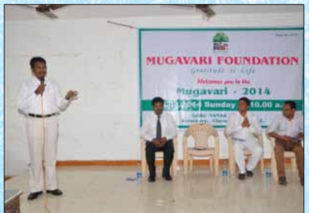
Mugavari Day, 16-02-2014

Harmony in the world will happen only when human beings are truly harmonious within themselves. Sadhguru