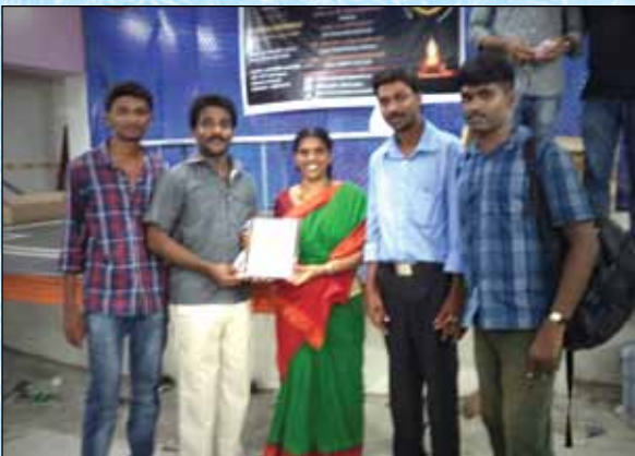
Mugavari receives Memento from Gold Heart Foundation on 27.10.2013