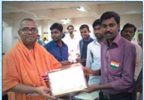
Mugavari receives Award from NDSO on 15.12.2013

Many people think management is just about throwing their weight around, but any fool can do that. Management is about inspiring people to do their best.