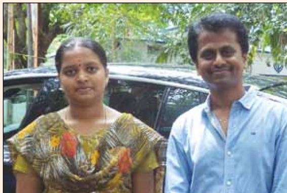
Mr. A.R. Murugadoss, Film Director, Chennai