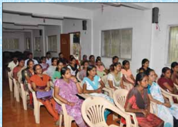
Mugavari Day, 16-02-2014