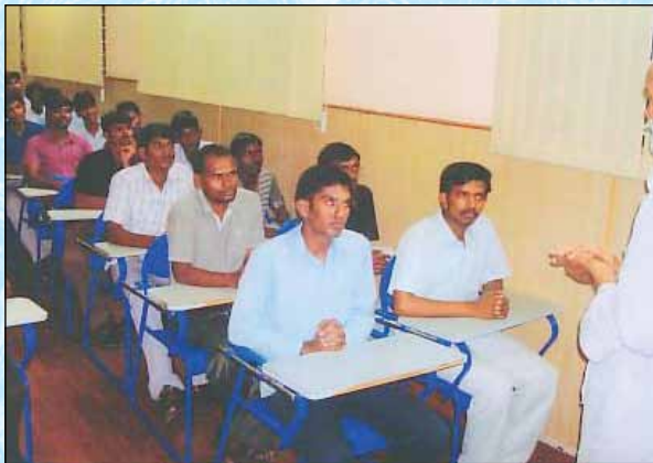
Chennai Students Meet, 12-1-2010