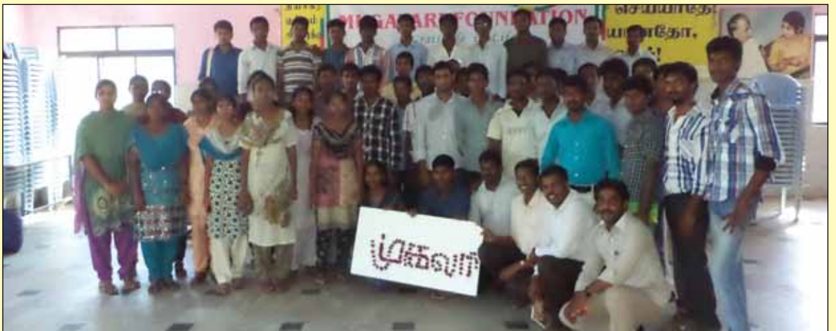
Mugavari Day, 2013

Destiny is what you create for yourself. Fate is when you fail to create your own destiny.