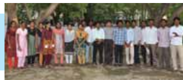
The Selection Committee for the year 2013.