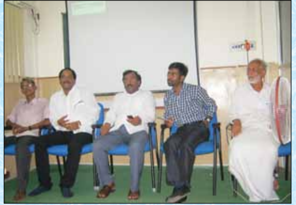
Mugavari Website Launch, 05-09-2011