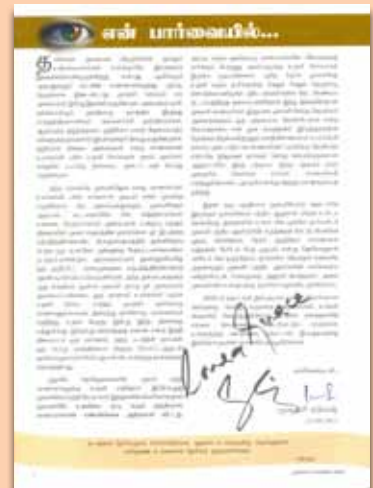
Sadhguru's Sign & Blessings for Mugavari on 25-12-2013