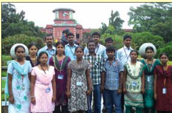
Anna University Students