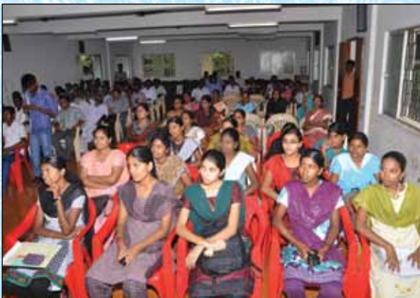
Mugavari New Students Meet, 18-08-2013