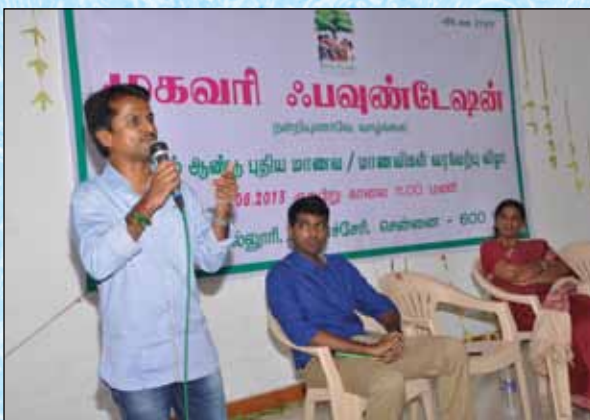
Mugavari New Students Meet, 18-08-2013