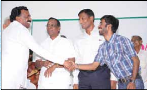
IAS, IPS, IRS Officers with Mayor, Magavari Family Function