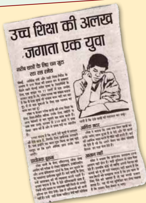
Article about Mugavari Foudation in Patrika News Paper, Rajasthan - June2014